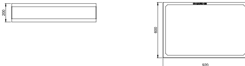
DAVOS U HIGH EXTENSION PART